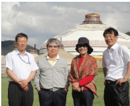
•• KSCE Delegation at the 2013 MACE Annual Meeting

The CECAR6 was held on August 20-22, 2013, at Hotel Borobudur, Jakarta, Indonesia, under the theme, "Embracing the