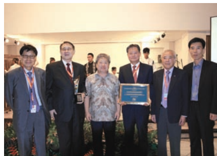
•• Awarding Ceremony at Gala Dinner

Future through Sustainability". The CECAR is organized by the Asian Civil Engineering Coordinating Council (ACECC) triennially since 1998. This year's conference was hosted by the Indonesian Society of Civil and Structural Engineers (HAKI). A total of 652 participants registered and 236 papers were submitted. Among 236 papers, 88 registrants and 46 papers were from Korea. At the conference, there were 8 Keynote Speeches, 28 Technical Sessions, 6 Special Sessions, 5 other programs including the Presidential Session on Infrastructure, and 2 Short Courses. Other participating countries include Indonesia (77 papers), Japan (42 papers), Taiwan (36 papers), Malaysia