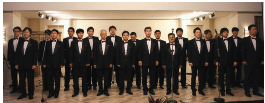
•• Performance of Civil Harmony at Gala Dinner