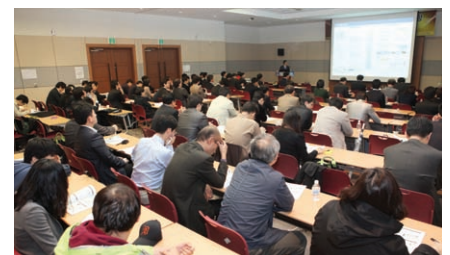
•• Parallel Session