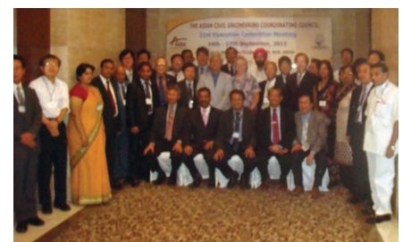
•• 21st Executive Committee Meeting

Presentations of bids to host the 7th CECAR was made and ASCE was unanimously selected to host the 7th CECAR in June 2016, at Hawaii, USA. The 22nd ECM will be