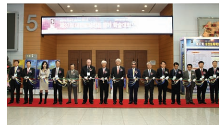
•• Civil Expo 2011 Tape Cutting Ceremony

This year's international program included the 1) International Roundtable Meeting (IRM); and, 2) International Students Meeting (ISM). The topic for the IRM was "Past, Present, and Future in Civil Engineering", which provided a forum to