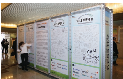
•• Signing Board of the "Declaraion of Vision for the Future"