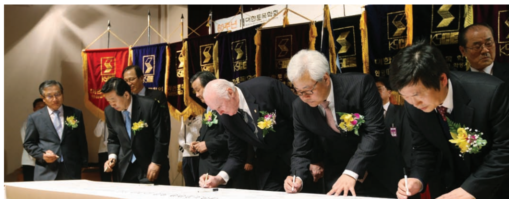
•• Representatives Signing the "Declaration of Vision for the Future"