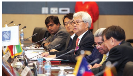
•• IRM Discussion