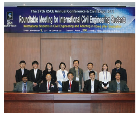
•• International Students Meeting