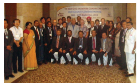
•• 21st Executive Committee Meeting

Presentations of bids to host the 7th CECAR was made and ASCE was unanimously selected to host the 7th CECAR in June 2016, at Hawaii, USA. The 22nd ECM will be