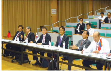
•• KSCE Delegation at the JSCE IRM