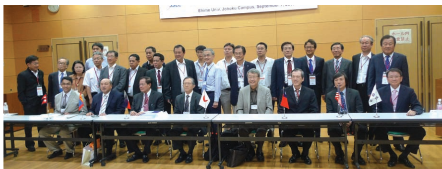
•• JSCE International Roundtable Meeting