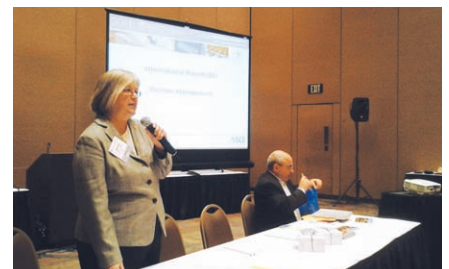
•• ASCE President Chairing the International Roundtable Meeting

Another focus was on "Disaster." There were various presentations on the analysis and research on disaster. A special session organized to invite distinguished scholars from Japan to present and discuss on the recent Tsunami that devastated parts of Japan drew the attention of many participants. Also, the ASCE was putting in efforts to spread knowledge and information on the deterioration of infrastructure in the USA that causes financial burden, which is also predicted to get more intense in the near future. There were different measures proposed to solve the problem. Since it is also an unavoidable problem in Korea, the presentations and proposals were very informative.