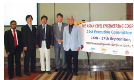
•• KSCE Representatives for 21st ECM