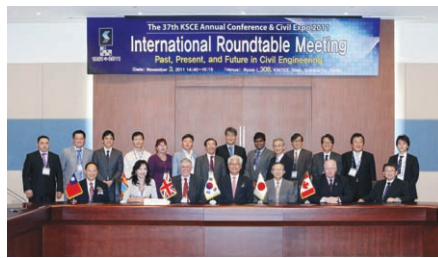
•• IRM Discussion

The 38th KSCE Annual Conference in 2012 is scheduled to be held on October 25-27, 2012, at Chonnam National University, Gwangju, Korea.