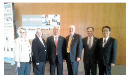
•• ASCE and KSCE Representatives