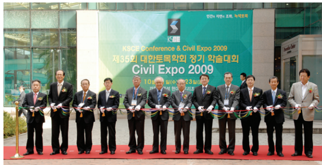
Tape Cutting Ceremony at the Civil Expo 2009

attendance, as 2547 participants from academic, research, corporate and government organizations registered for the conference. If the approximately 400 workers at the Civil Expo are included, the conference was shared by approximately three thousand people. Civil Expo 2009 had 65 booth representing 45 companies and organizations. Total of 911 papers were presented including 284 oral presentations and 627 poster presentations.