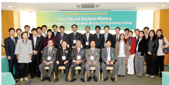
After International Students Meeting at the 2009 KSCE Annual Conference