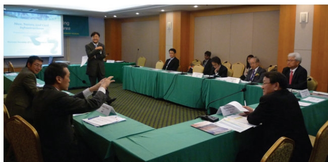
International Roundtable Meeting (2009 KSCE Conference)